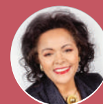
H.E. Nardos Bekele-Thomas CEO, AUDA-NEPAD

“ It is a pivotal moment to promote a shared vision and clear and implementable roadmap through SEZs as a catalyst for a prosperous, equitable, and resilient Africa, in alignment with Agenda 2063: The Africa We Want. ”