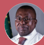
H.E. Ambassador Albert Muchanga Commissioner for Trade and Industry, African Union Commission

“ We must incorporate sustainable principles into the design and planning of SEZs to protect the environment and conserve our natural resources. Sustainable economic development is not merely an aspiration but an imperative ”